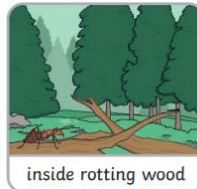
inside rotting wood