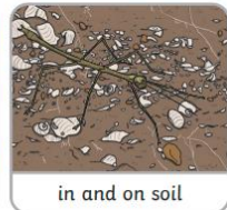
in and on soil